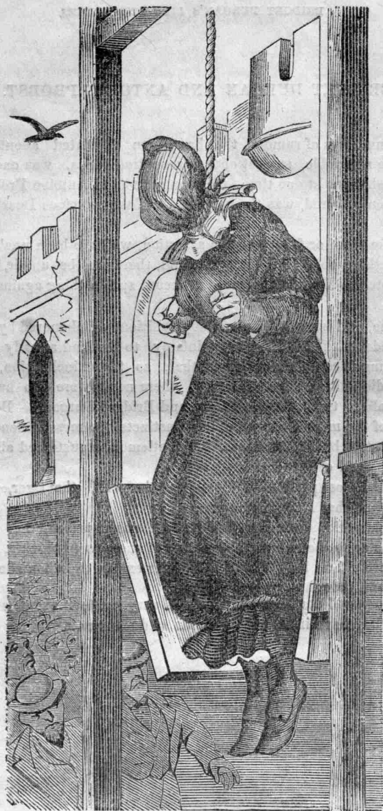
THE FINAL ACT OF JUSTICE. Execution of Bridget Durgan, at New Brunswick, New Jersey.